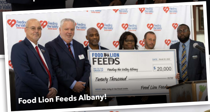
Food Lion Feeds Albany!